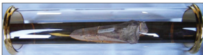
A portion of the tibia of Saint Mary Magdalene is enclosed in a glass tube and then placed in the reliquary