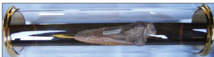
A portion of the tibia of Saint Mary Magdalene is enclosed in a glass tube and then placed in the reliquary