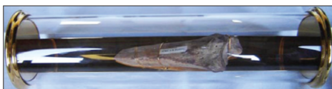
A portion of the tibia of Saint Mary Magdalene is enclosed in a glass tube and then placed in the reliquary