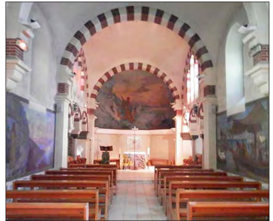
Chapel of Saint Mary Magdalene in the hostellerie