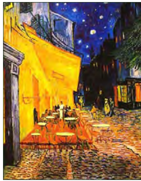
Le Café de nuit