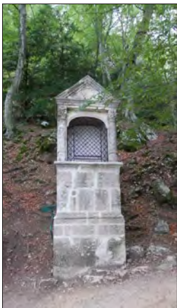
Oratory built along the Chemin des Roys