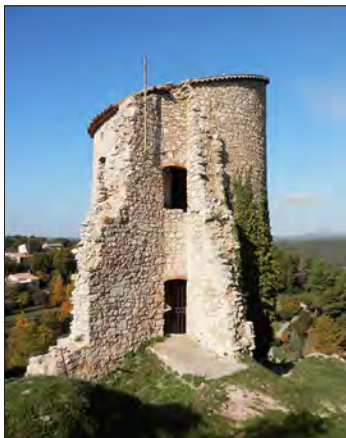
Castle of Pontevès in ruins