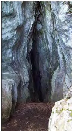
Grotte des Oeufs