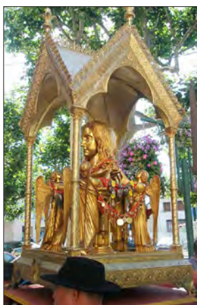
Saint Mary Magdalene's skull in a gold reliquary