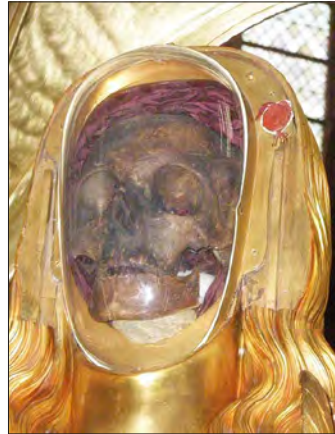
Saint Mary Magdalene's skull in a gold reliquary