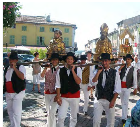
Les Saints de Provence in procession