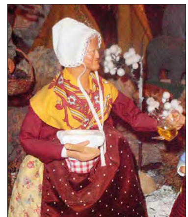
Santon - Olive Oil Lady