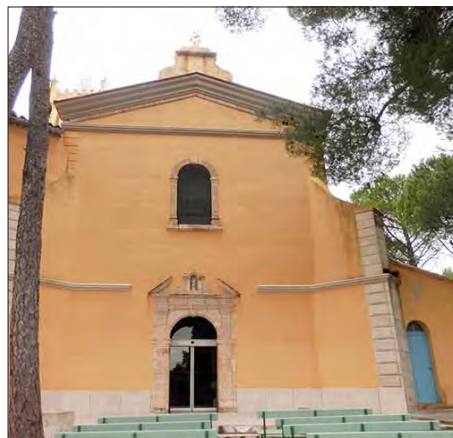
Notre-Dame de Grâces in Cotignac