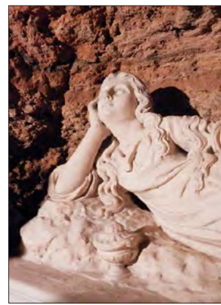
Sainte-Marie-Madeleine dans la crypte des Aygalades