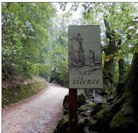
La forêt—Chemin des Roys