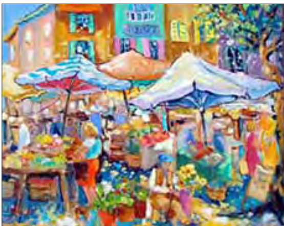
Market Day in Aix Provence by Sharon Furner

Tour bus will take us to the fabulous Market in Aix-en-Provence . We will visit Cathédrale Saint-Sauveur , which was built in the twelfth century on the site of an ancient temple dedicated to the sun god, Apollo. St. Maximin and St. Mary Magdalene erected a small chapel on this site dedicated to Jesus Christ ( Saint-Sauveur ). The baptistry in the Cathédrale, built in the fourth or fifth century, is one of the oldest in France. You will have several hours on your own to explore the old town of Aix and to stop and have lunch. In the afternoon we will go to a workshop where they make Santons de Provence . Their origins go back to the first representation of the Nativity by St. Francis of Assisi when he recreated the first “live” Nativity using real people and figurines.