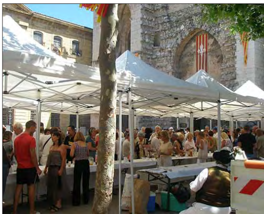
Feast Day celebration