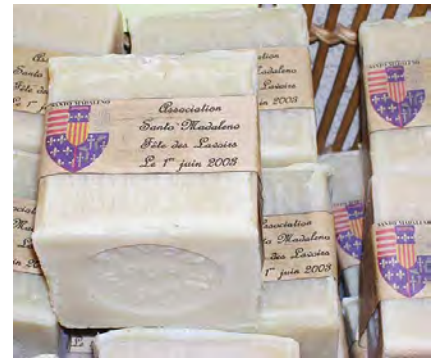
Savon de Provence