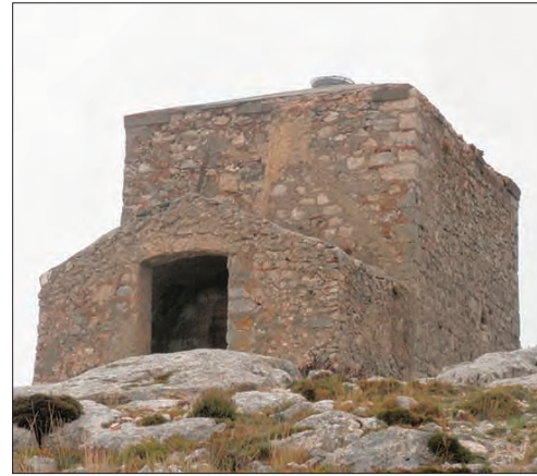
Chapel St. Pilon, built on the crest of the Massif de la Sainte-Baume