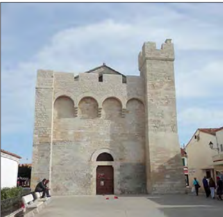
Parish church in Saintes-Maries-de-la-Mer