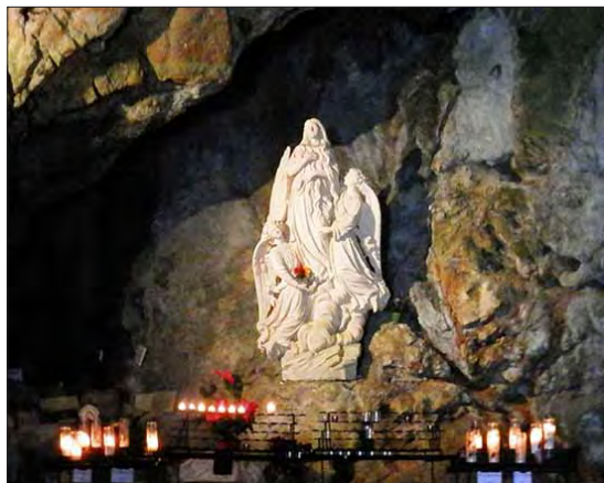
La Sainte-Baume Cave of Saint Mary Magdalene