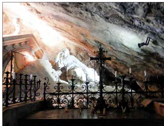
La Sainte-Baume Grotte de Sainte-Marie-Madeleine