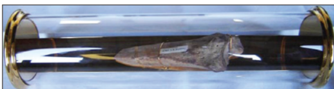
A portion of the tibia of Saint Mary Magdalene is enclosed in a glass tube and then placed in the reliquary